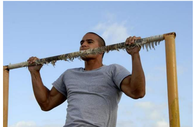
The Coast Guard is looking exercises such as dead-hang pullups, for a possible PT test.

Extract from article By Antonieta Rico NavyTimes Staff writer