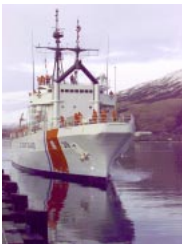
CGC Alex Haley (WMEC 39) arrives in Kodiak November 1999

Under a new law, the Veterans Millennium Health Care and Benefit Act, veterans should see improvements in several areas. VA is supposed to improve access to long-term care for disabled veterans, along with other health care, educational and burial benefits. VA will also be looking into ways to provide a range of nursing and related care and to help families. Some of the specific provisions of the new law would extend the housing loan program for certain reserve members; let veterans to use their Montgomery GI Bill money for certain test prep courses; let VA pay emergency care costs for veterans receiving medical care from VA and will have VA look into establishing six new national cemeteries.