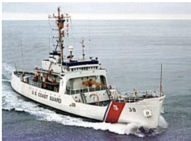
USCGC Storis on patrol off Alaska

The Coast Guard Retiree Council – Northwest reopened the Retired Affairs Office, ISC, Seattle, WA on May 24 th , 2000. The office is located in Building 1, Integrated Support Command, Seattle, Rm. 151. The current hours of operation are 0900 to 1400, Wednesdays only. The telephone number is (206) 217 6188, if no one answers your call, please leave a message so a return call can be made. The email address for the office is Evblack@pacnorwest.uscg.mil . (Since staffing is only one (1) day per week please email any member of the Council with your questions). Email to the office will not be answered until the following Wednesday.